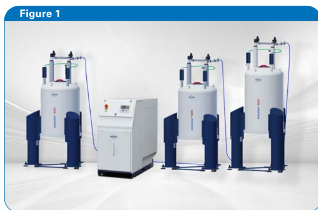
Figure 1: Artist's view of the setup described in the installation example with one recovery unit and three NMR magnets. The high pressure storage is not shown.